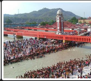
Har ki Pauri